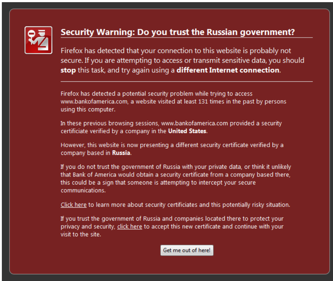
Figure 2: The warning displayed to users of Certlock.